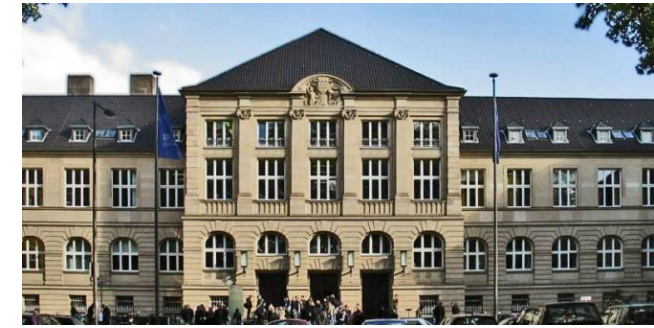
Cologne Research Centre for Reinsurance